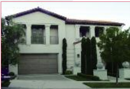
Sun Residence, Newport Coast, CA