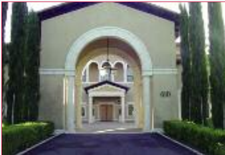
Soka University, Aliso Viejo, CA

While each project has its own unique characteristics, they all share one common trait...state-of-the-art quality construction.